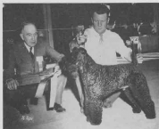
Wins his 15th BEST IN SHOW under his 14th different judge at Dallas, Texas, March 24, 1956.