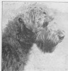
CH. NORA JACOBIN. Sire of over fifty-five winners.