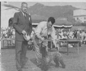
CH. KERRYALL'S SKIPPER