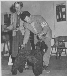
CH. VIXEN'S SHOW OFF