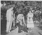
CH. VIXEN'S SHOW OFF