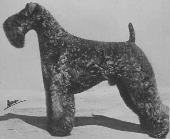
CH. FOX HILL'S THUNDERBOLT

KERRY BLUE TERRIERS The Kennel of Champions