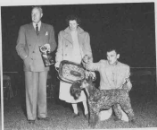
CH. GILBERT'S SIR ROBERT