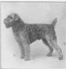
CH. NORA JACOBIN. Winner of six K.C. challenge certificates and fifty first prizes.