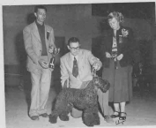
CH. FOX HILL'S MARAUDER