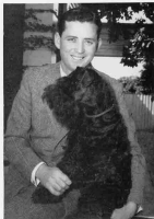
CH WULFREDA RHAPSODY

With the variety of celebrities which Fermoy houses, including the fabulous winner Ch Wulfreda Rhapsody (best exhibit at the 1959 Melbourne Royal show) and Ch Fermoy Fagan (best Terrier at Melbourne Royal show, 1960) surely Fermoy must be tops during 1962.