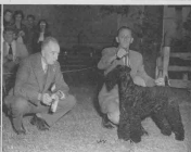
KERRY ACRE'S MIGHTY MAN