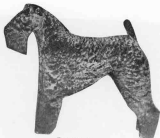
Kerry Blue Terrier