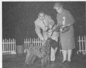
Kerry Blue Terrier