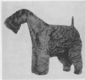
CL. DARTY DORIE at 11 1/2 years old