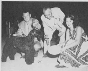
CH. VIXEN'S SHOW OFF