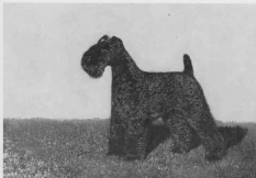
CH. WIL SHAMROCK OF MAYFIELD