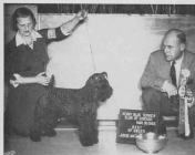
AM. & CAN. CH. TAILTEANN'S MISS GAITY