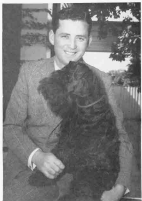
Ch WULFREDA RHAPSODY

With the variety of celebrities which Fermoy houses, including the fabulous winner Ch Wulfreda Rhapsody (best exhibit at the 1959 Melbourne Royal show) and Ch Fermoy Fagan (best Terrier at Melbourne Royal show, 1960) surely Fermoy must be tops during 1962.