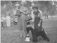
SEYMOUR'S BRIGHT OF SOMERSET

It's seldom Kerry Blue exhibitors and breeders catch three shows in a mere 48 hours — with the Kerry Blue Club of Texas specialty show Friday night, March 25th, at Dallas, Texas, they'll have a start on a royal week-