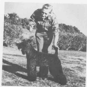
Kerry Blue Terrier sire of 6 champions