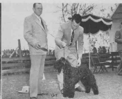
VIXEN'S SHOW OFF