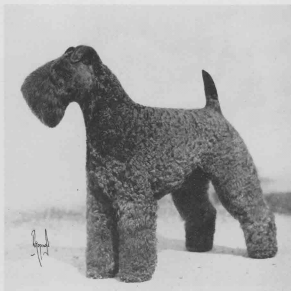
CH. MICHAEL OF SOM'SET JR.