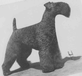
CH. CONRAD'S CHALLENGE