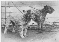
BLUE LAGOON OF LEYFIELD AND CH. JOE OF LEYFIELD. Photos, Chapman, Birmingham, LEYFIELD.