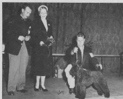
CH. BLUE FEATHER OF PARK CREST