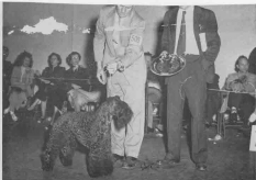
CH. KEARNACH FALTHA