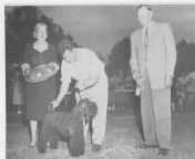
CH. VIXEN'S SHOW OFF