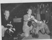
CH. GERO'S CANDY LAMB