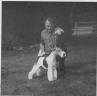
Eng and Am Ch TARNBRICK HARANWAL DIPLOMAT