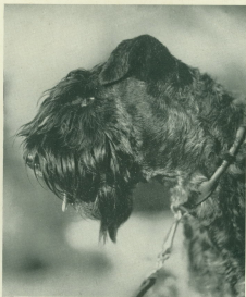
CH. GLOUNTHANE HERO (Kerry Blue Terrier)