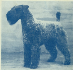
CH. BLACK PRINCE OF THE CHEVIN (Kerry Blue Terrier)

Owned by BLUE LEADER KENNELS Santa Barbara, California