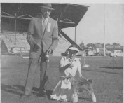
JONAIRE POCONO HIGH HAT