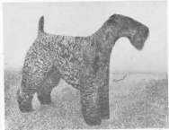
CH TOAST OF ARMSHEAD