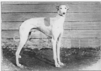
THE GREYHOUND, FISHERMAN. A big winner and sire of winners. Stud fee, 25/6.