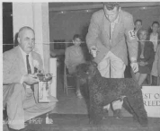
Wins 8th Annual Specialty, Kerry Blue Terrier Club of Texas, March 23, 1956.