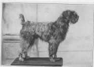
KERRY BLUE TERRIER Outpost Leader, owned by Outpost Farm Kennels, Ridgefield, Conn.